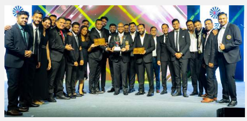
Best Fellowship Club