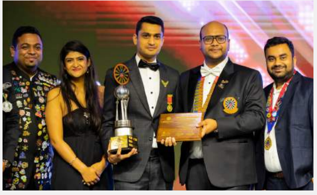
Best RTI/RTN Day Celebration